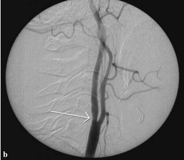
FIG. 1. — Carotid angiography performed in 1993 showing a) occlusion of the left internal carotid artery, b) stenosis of the right carotid artery..

al. , 2006; Héman et al. , 2009). In our patient, the existence of the aneurysm was not demonstrated before CE surgery. However, usually intracerebral aneurysms in combination with carotid artery stenosis are detected during angiographic procedures for stenosis and are still asymptomatic. Once an aneurysm has ruptured, it is generally recommended that the aneurysm should be treated before the endarterectomy is performed (Porter et al. , 1997). The management of unruptured aneurysms in association with a significant internal carotid stenosis is still subject for discussion and the risk of rupture